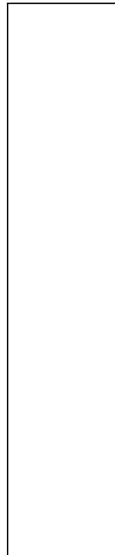
Skyscraper | 120 pixels x 600 pixels